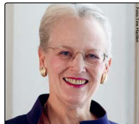
Her Majesty Queen Margrethe II

The Tivoli Guard and Aalborg Police Orchestra: The Tivoli Guard is performing at several concerts during the whole year both in Denmark and abroad, and of course in Tivoli in Copenhagen. The Aalborg Police Orchestra was also performing at the Rebild Celebration in 2010 and 2011, and again this year we get the opportunity to listen to this fantastic orchestra.