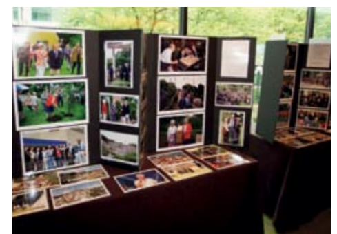
Nohr's photo exhibition with more than 350 pictures.

Yes, I order one poster. Price: $100 (plus postage)