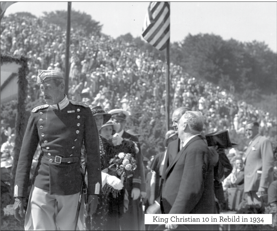
King Christian 10 in Rebild in 1934

That was the Rebild Celebration No. 1, and since then a Rebild Celebration has been held every year through 100 years – with quite few exceptions. It is remarkable that the program of the first celebration has almost been kept as a tradition. The President strikes a copy of Liberty Bell, and everybody rises, while Dannebrog and then