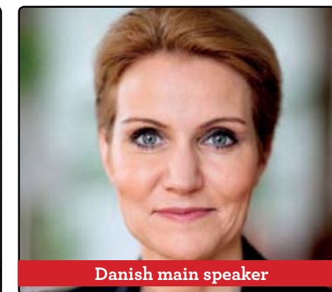
Danish main speaker