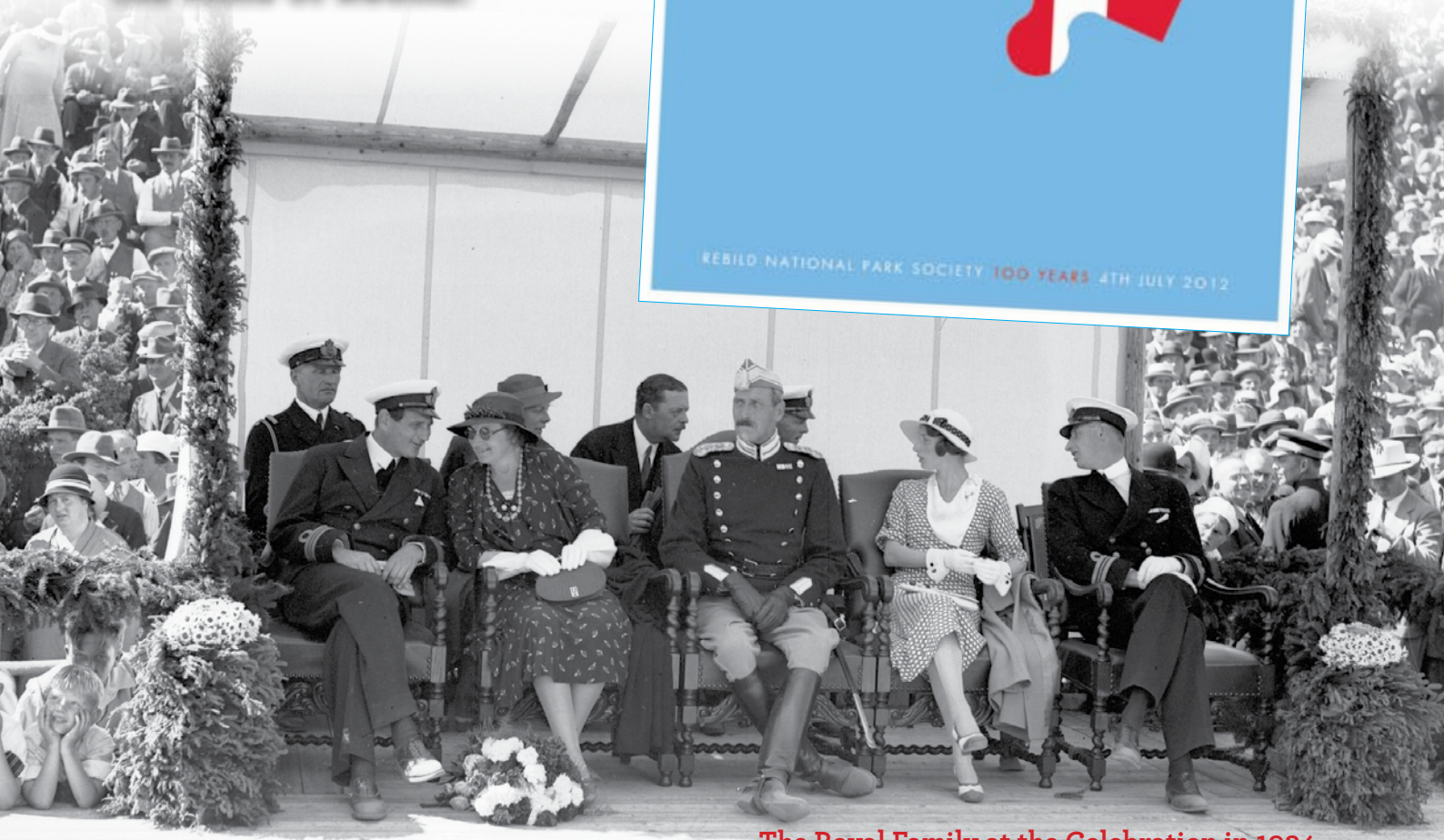
The Royal Family at the Celebration in 1934