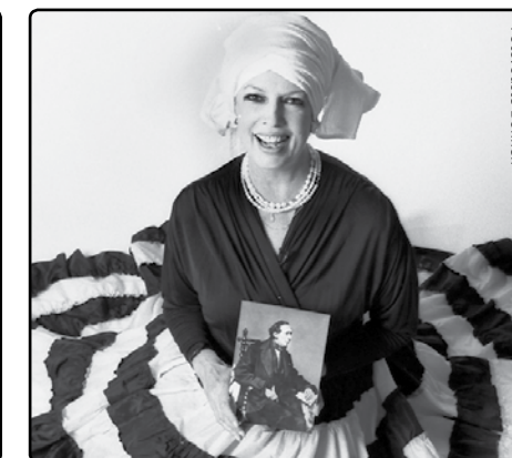
Author Suzanne Brøgger