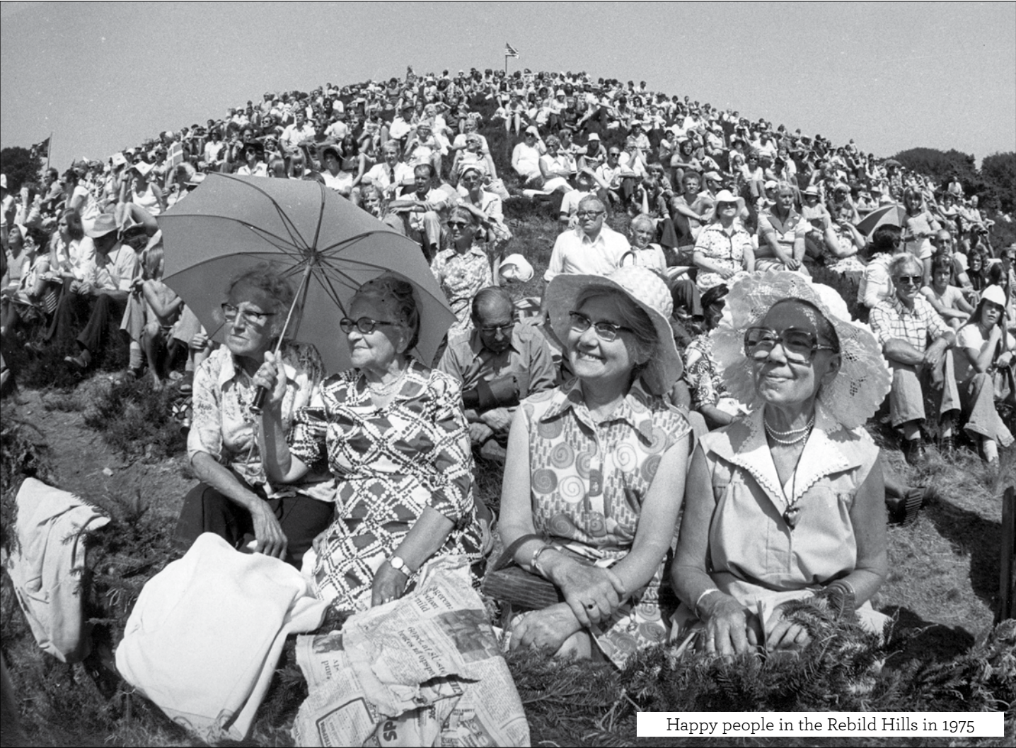
Happy people in the Rebild Hills in 1975