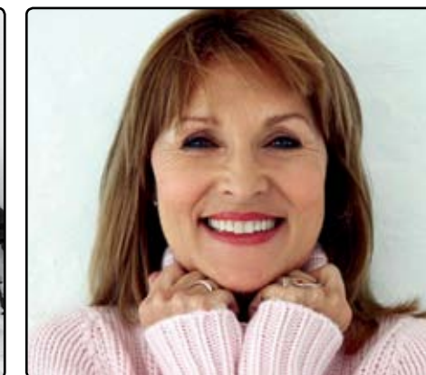
Actor Susse Wold