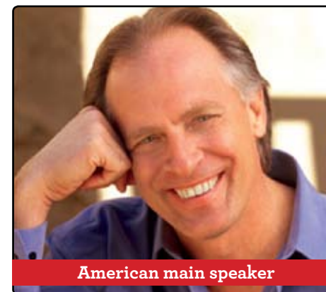
American main speaker