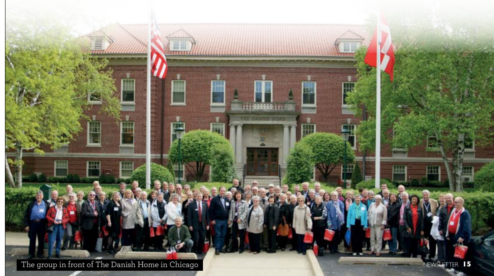
The group in front of The Danish Home in Chicago