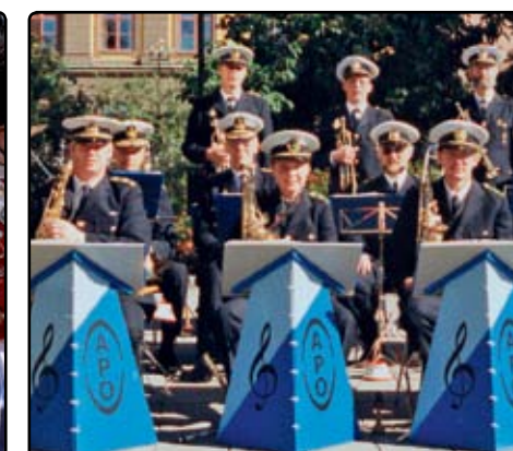
Aalborg Police Orchestra