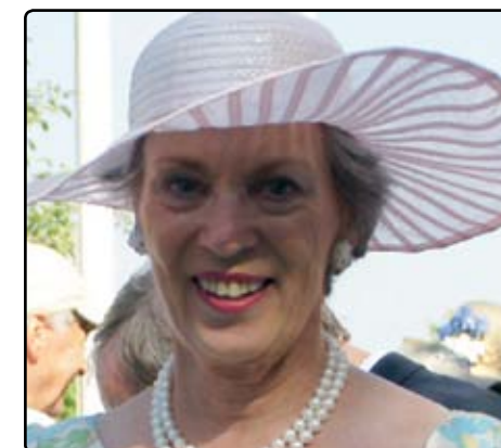
Her Royal Highness Princess Benedikte