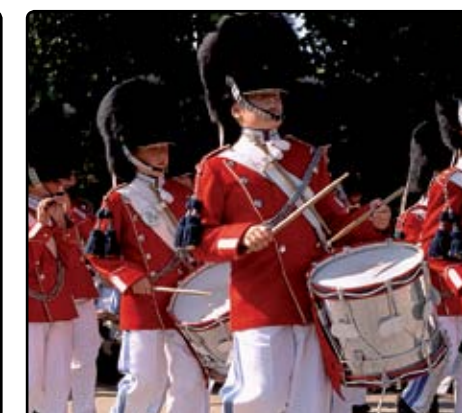
The Tivoli Guard