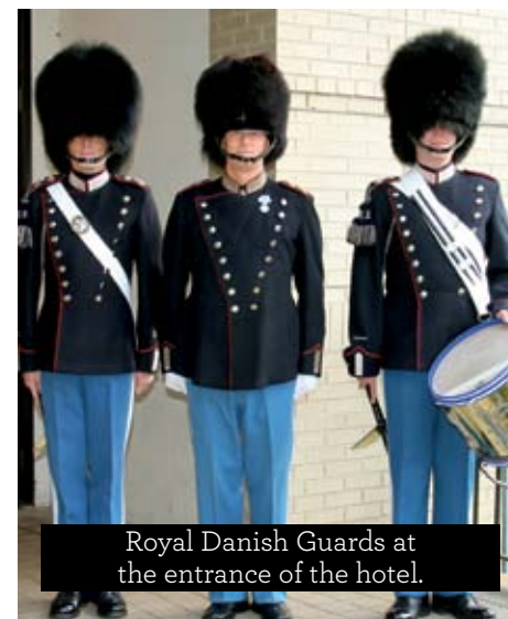
Royal Danish Guards at the entrance of the hotel.