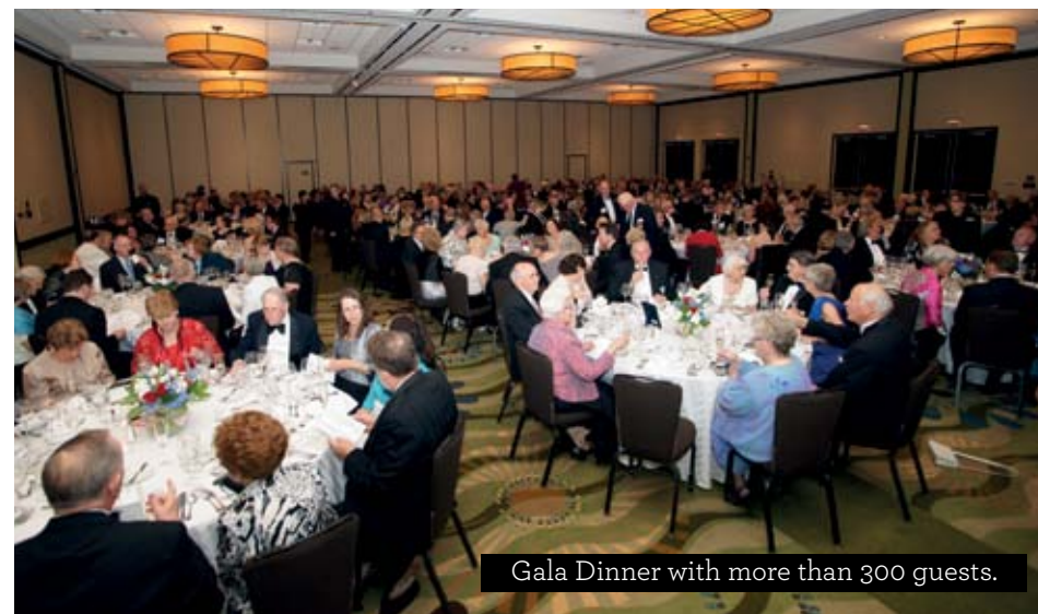
Gala Dinner with more than 300 guests.